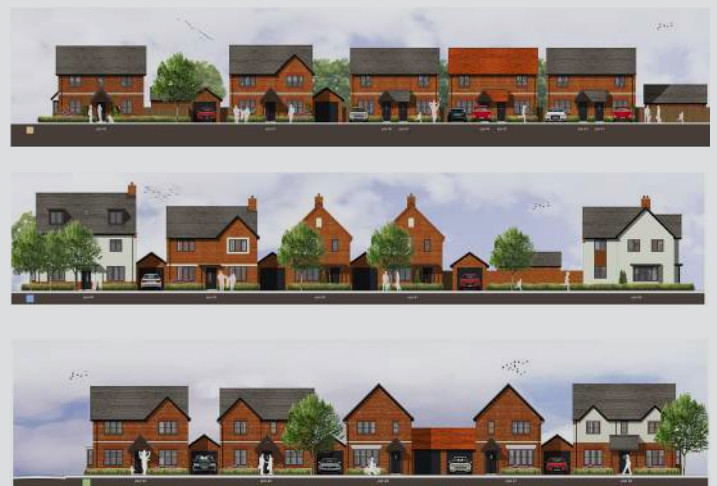
A selection of elevations from the spine road, site edge and central area.

As shown on the masterplan above, extensive landscaping is provided throughout the development and along the site's boundary.