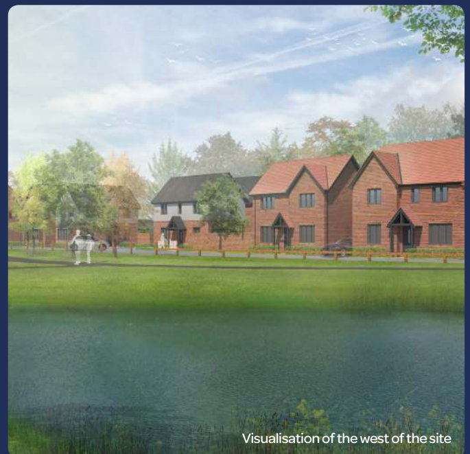
Visualisation of the west of the site

Bloor Homes will deliver the first phase of residential development at Blythe Valley Park and are preparing a reserved matters application for 170 homes. The reserved matters application will provide details on house types, layouts and designs, as displayed in this newsletter.